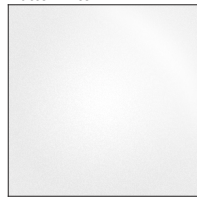
Matte White - MWH